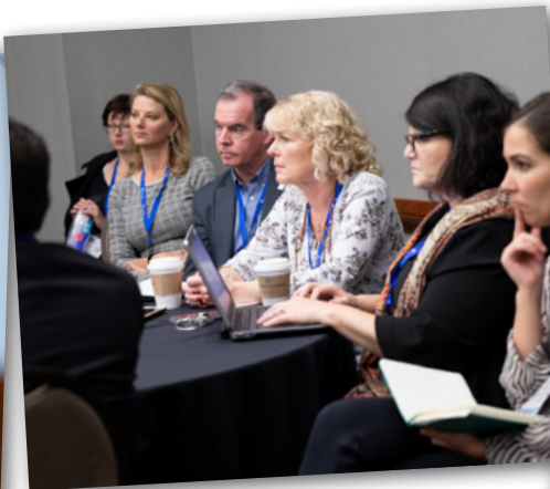
Discussion group in process.