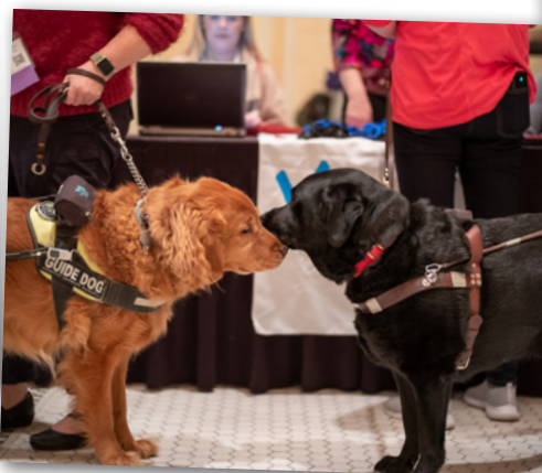
Everyone (dogs included) enjoyed the welcome reception