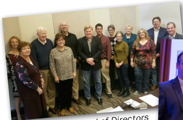
VisionServe's Board of Directors meeting