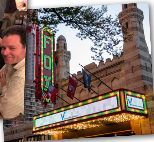
VisionServe's name in lights on the FOX Theatre marquis!