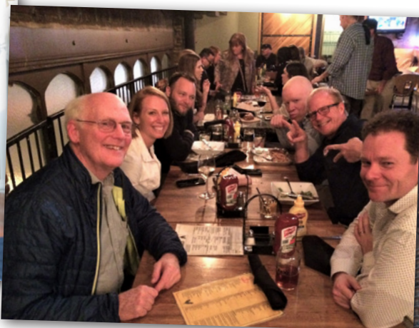
This year's Dine Around went digital! Always a fun time.