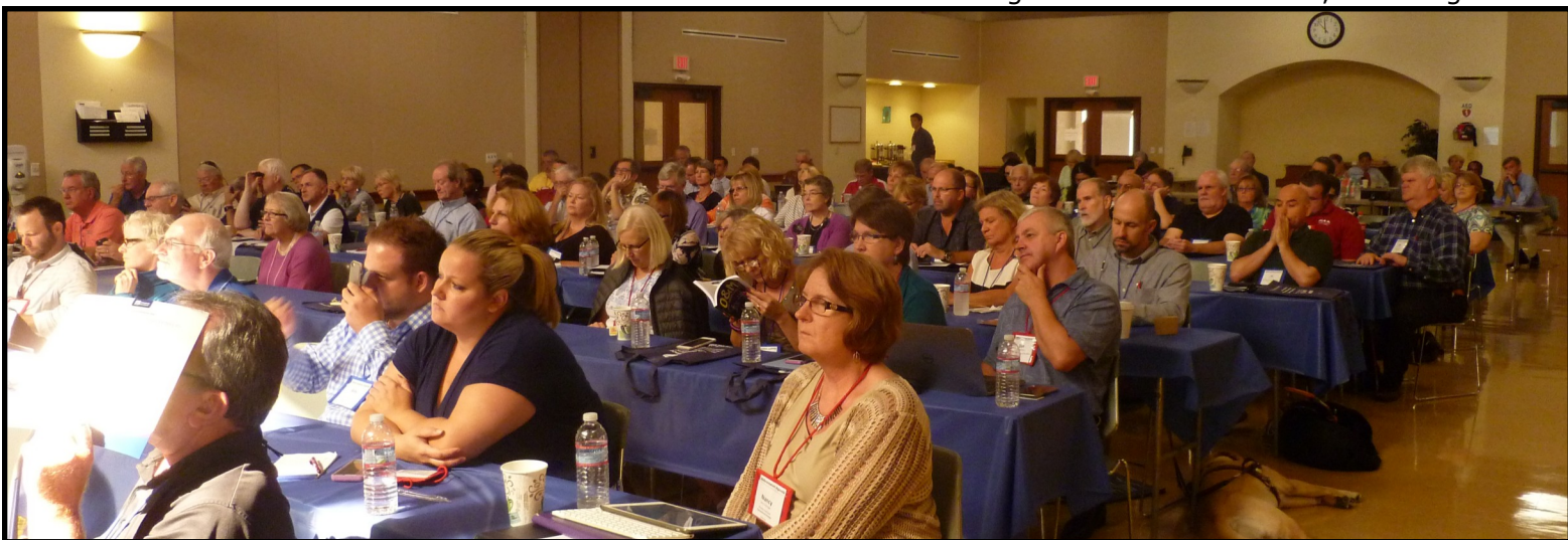
Meeting at Braille Institute—San Diego