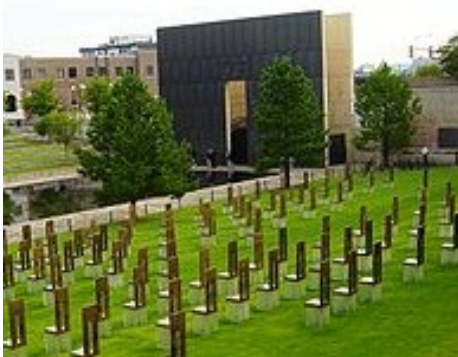
The Oklahoma City National Memorial and Museum

We took time to honor those lost in the Oklahoma City bombing with an emotional tour of The Oklahoma City