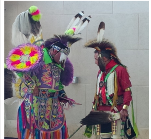
Native American Dancers