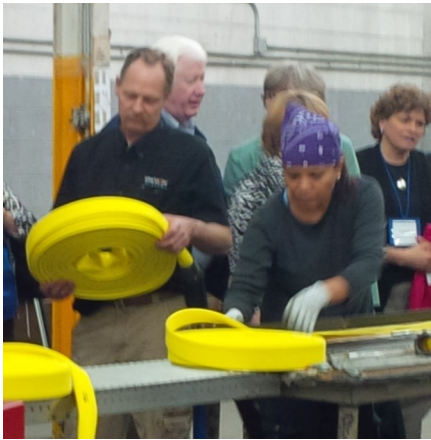
NewView employees making hoses