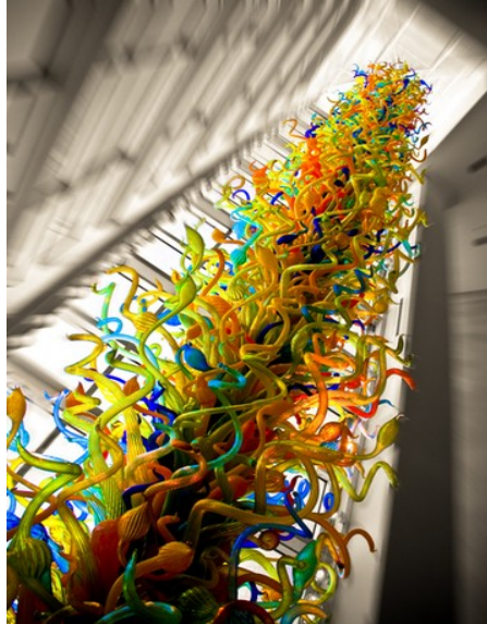
Dale Chihuly: An Inaugural Exhibition at the Oklahoma City Museum of Art

National Memorial and Museum. Friday night took us to the Oklahoma City Museum of Art where