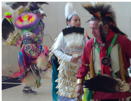
Native American Dancers