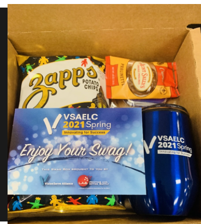
A thoughtful gift – the VSA ELC swag box for our virtual attendees