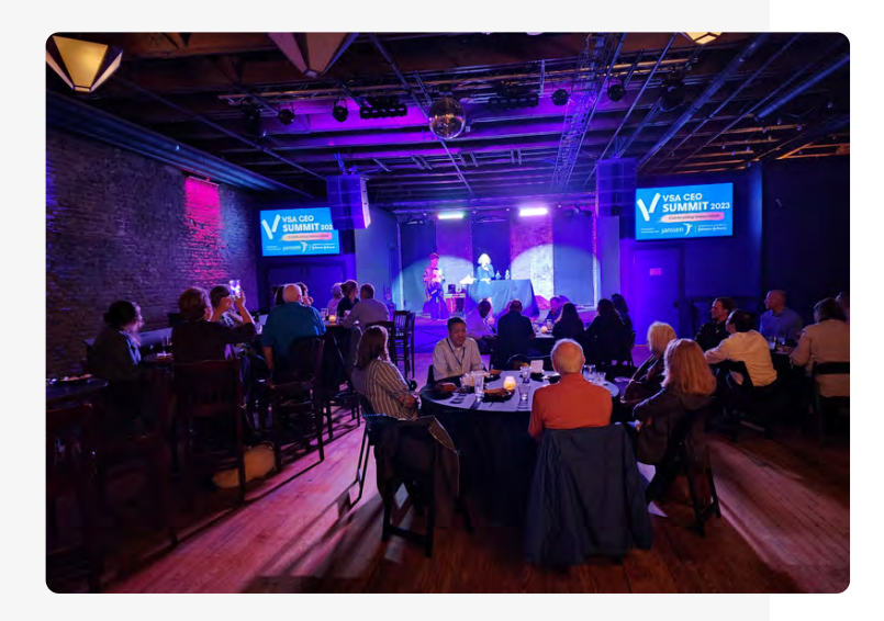
Annual Awards Ceremony