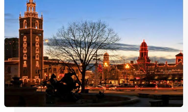
Country Club Shopping Plaza