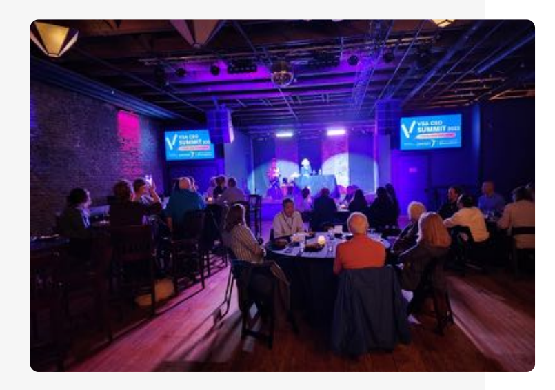
Annual Awards Ceremony