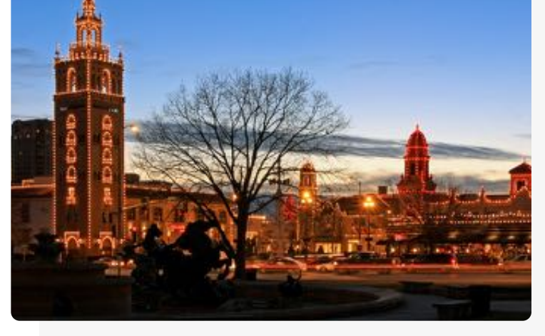
Country Club Shopping Plaza